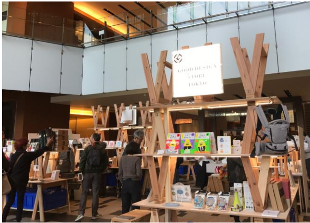
■POP UP STORE in 2017