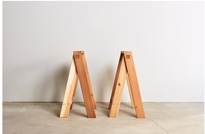
■AA HIGH STOOL

The shop design was commissioned to Torafu Architects which will also design the GOOD DESIGN EXHIBITION 2018 venue layout.