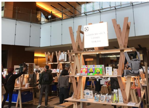
■POP UP STORE in 2017